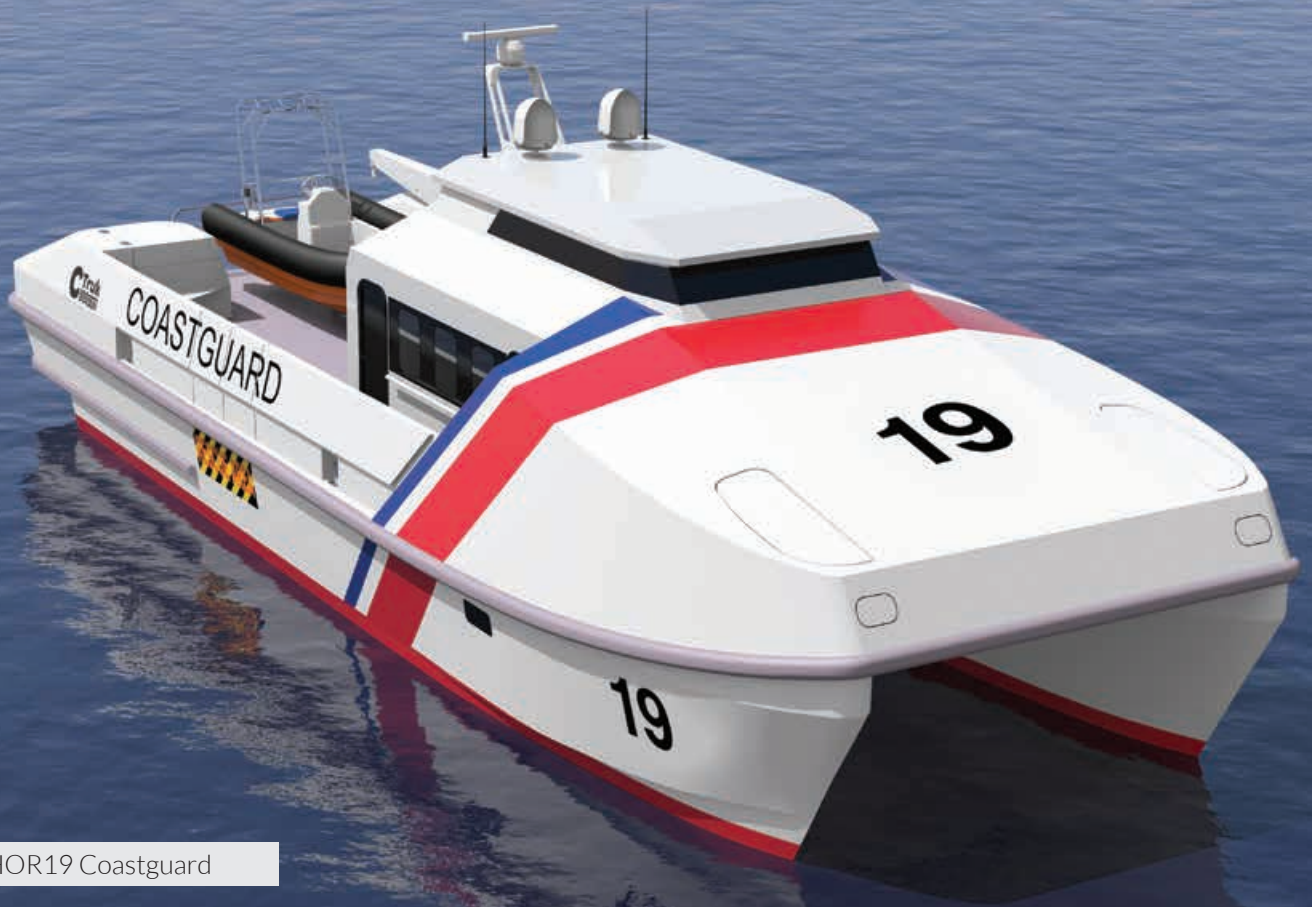
▶ CTruk THOR19 Coastguard

CTruk's advanced composite THOR19 is based on a proven offshore support vessel design, offering a robust and stable 19m twin hull platform with CTruk's patented flexible payload arrangement giving multi-role capability.